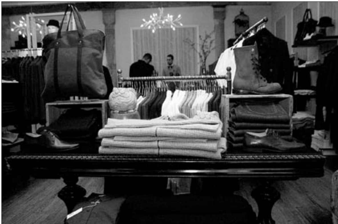
Odin helps prove that the clothes do, in fact, make the man.